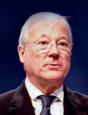
Ramón Luis Valcárcel Siso

President of the Committee of the Regions