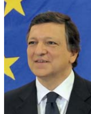
José-Manuel Barroso President of the European Commission

I very much welcome this handbook and thank the Committee of the Regions for bringing together in one place all the information to make Europe 2020 happen on the ground. I am confident that it will be an important tool for municipalities and regions to succeed in achieving our common goal of boosting sustainable growth and competitiveness for our citizens and our businesses.